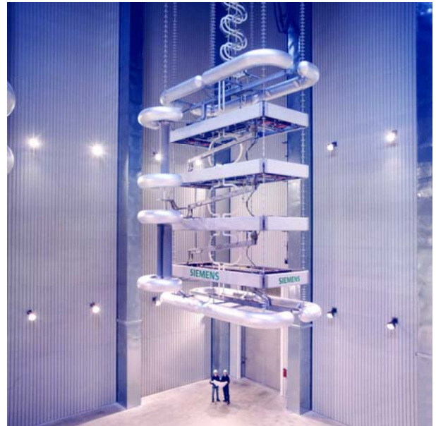
Fig. 2: UHV DC Valve Tower in the Cologne testing laboratories

Now during the open-line-test the substation Chuxiong has been tested with 800 kV DC voltage. This test has proven the insulation and readiness for operation of the line, DC yard and sending station converter for the worldwide first 800kV DC technology. It was successful at the first go. Now the UHV DC (see figure 3) is going to be set into commercial operation in December, 2009.