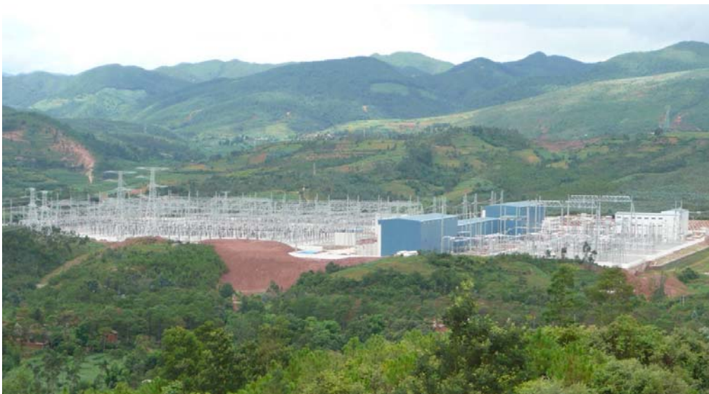
Fig. 3: UHV DC Sending Station Chuxiong in Yunnan, China